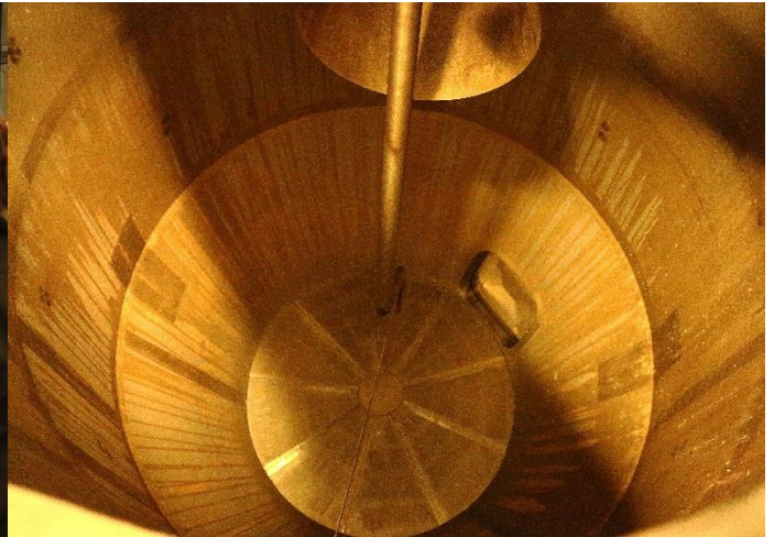
One of the impressive tanks used in the processes